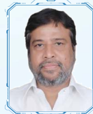
Shri. Damodara Raja Narasimha Garu Hon'ble Minister for Health & Family Welfare, Govt. of Telangana