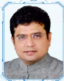
Shri. Duddilla Sridhar Babu Garu Hon. Minister for IT, Electronics & Communications, Industries & Commerce, Govt. of Telangana